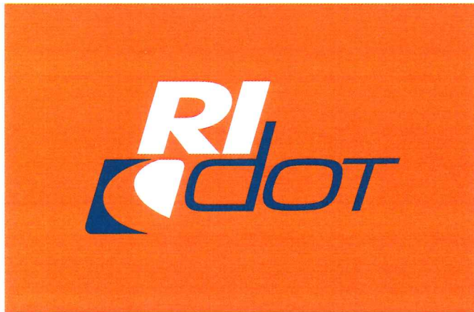
Safety Orange Shirts