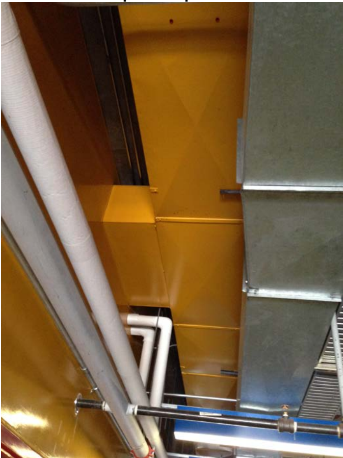
Ductwork to be painted