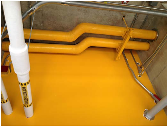
Pipes to be painted