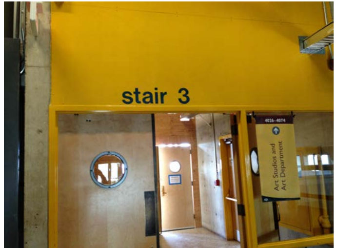
Stenciling to be masked off