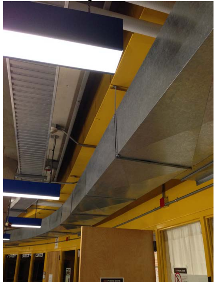
Sixth Floor Round Building